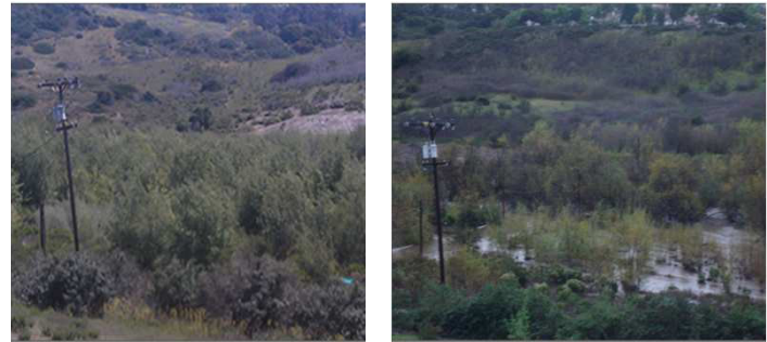
Haymar area before and after rainfall in December 2010

Problem: In late December 2010, a weather pattern dubbed the "Pineapple Express" resulted in heavy rainfall in Southern California. In one week, many cities in the region received as much rain as normally falls in a year. Not surprisingly, this weather pattern created massive inflow and infiltration and placed enormous pressure on the sewer lines.