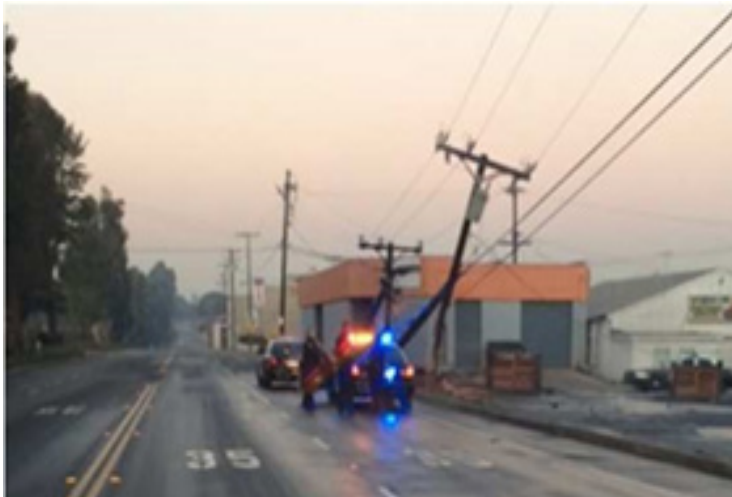
A drunk driver knocked down two power poles.

PROTECTING THE PACIFIC OCEAN WAS CRITICAL; REAL-TIME MONITORING COMBINED WITH QUICK RESPONSE AVOIDED CATASTROPHIC OUTCOME