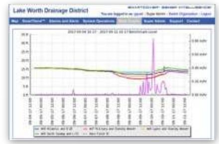
LWDD's Data during Hurricane Irma