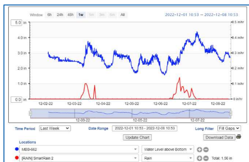
Water Leak or Infiltration and I&I

This evaluation provided collection system information which indicated the extent of potential I&I throughout the system with improved coverage, greater speed, and reduced cost. Simultaneously, the data produced by the SmartCover technology was used to identify and predict system surcharges and associated flow obstructions or material blockages. The NJAW Operations & Maintenance team benefitted from both the real-time alarms and predictive alerts by taking proactive actions before issues occurred.