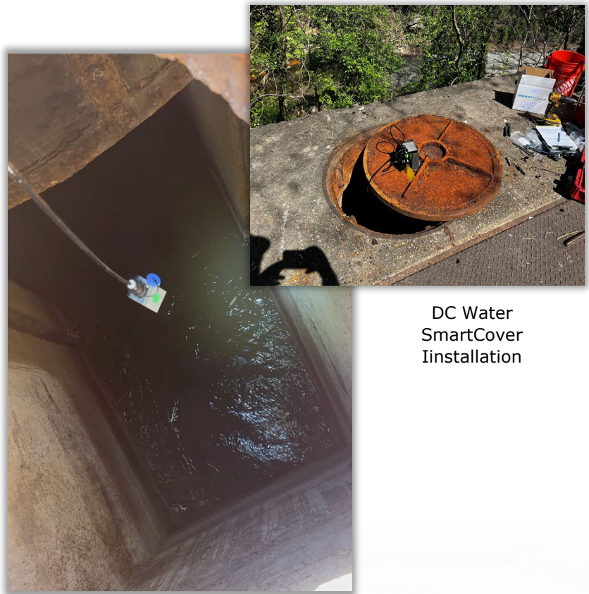
DC Water SmartCover Installation