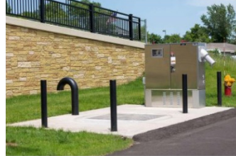
Lift Station Monitoring