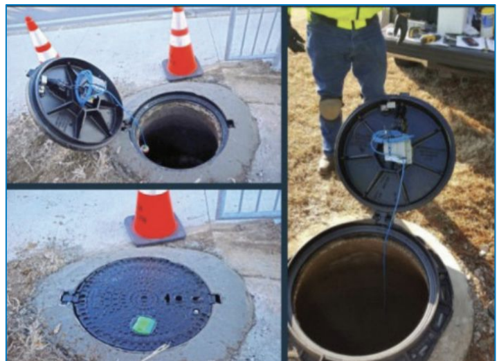
Figure 1: Installation of SmartLevel unit