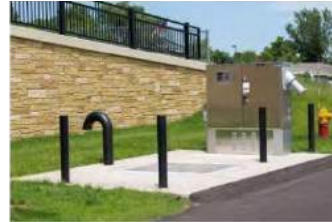
Lift Station Monitoring